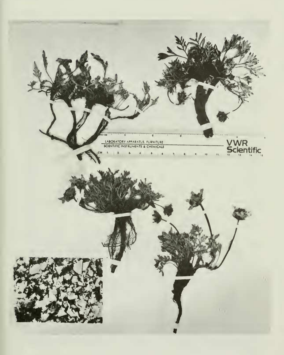
Figure 1. Herbarium specimen of Thelesperma muelleri , R.A. Schneider, et al. 940 (F).